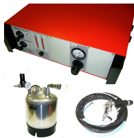
Penetrant Equipment for Electrostatics