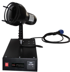
UV100 Hand Lamp