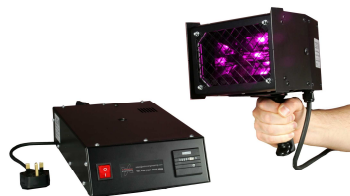
UV400 Flood Lamp