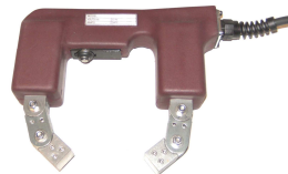
AY 1 Electromagnetic Yoke