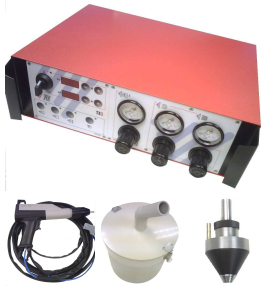
Developer Equipment for Electrostatics